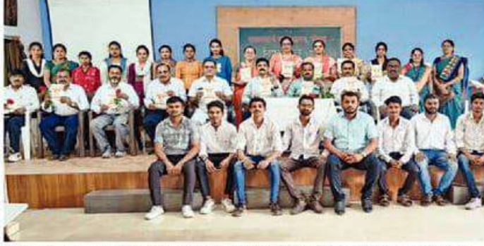
चोपड्यातील समाजकार्य महाविद्यालयात शिक्षक दिनानिमित्त आयोजित कार्यक्रमात शिक्षकांचा सत्कार करण्यात आला.