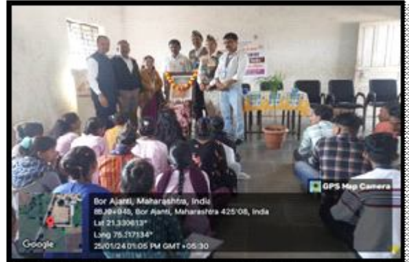
NSS Special Camp at Borajanti Village