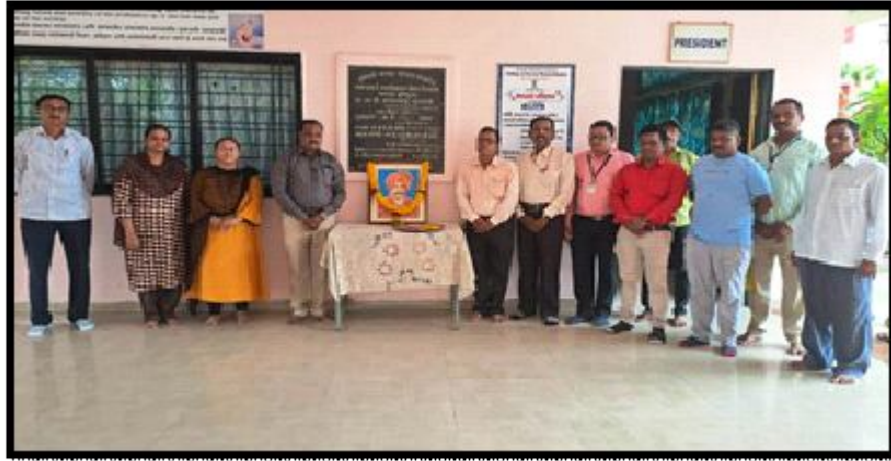
Birth Anniversary of Shahu Maharaj