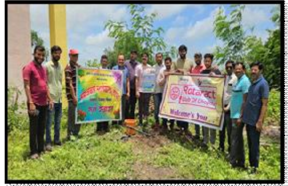
Tree Plantation Program in college campus.