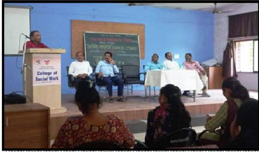
Guest Lecture on Economic Literacy