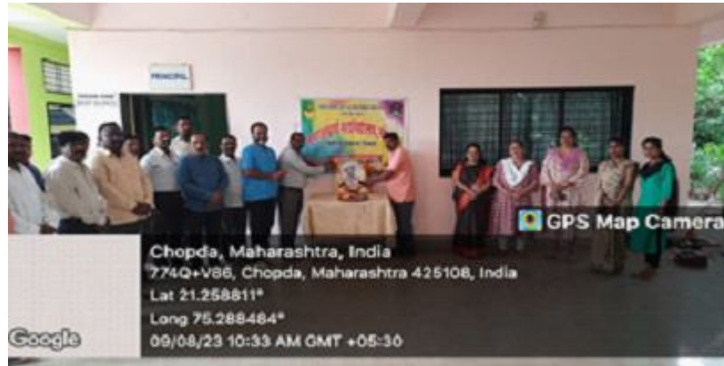
Birth Anniversary of Birsa Munda & Adivasi Divas