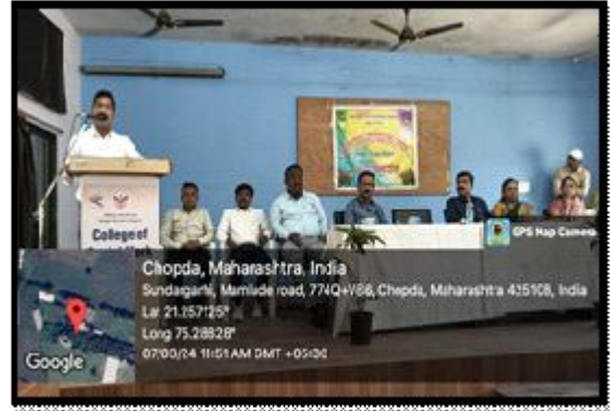
Evolution competition on Jal Jivan Mission