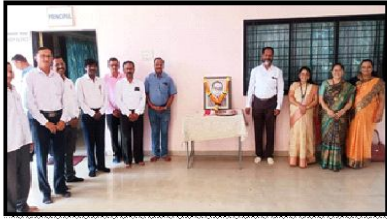
Death Anniversary of Dr. Babasaheb Ambedkar